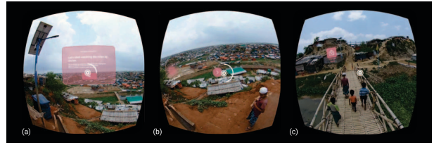
Fig. 1. The 3 phases of the prototype during the AN condition.(a) On-boarding: An introduction of the system, (b) Landscape: Navigate the refugee camps via the panoramic landscape, (c) Location Exploration: Watching the 360-degree videos about a selected locations.

Several theories have been used to justify the use of different navigation modes in VR. For example, Wilson et al. [20] presented a mode of psychologically active navigation in which the subject could freely explore in VR. Sauz on [7] suggested that active navigation can benefit object recognition and relational processing because it involves planning skills. In the gaming domain, Ferguson [8] found that navigating freely encourages users to onboard more spatial information and further explore environments. Another study by Cao et al. [21] also found that people in active exploration conditions find treasure hunting more difficult due to the intensive acquisition and spatial knowledge processing required. As noted above, 360° videos have been used to explore the lives of refugees via panoramic and omni-directional views [22], which enables viewers to explore more details compared to two-dimension fields of view. However, most 360° videos present content as a narrative documentary, which prevents viewers from being able to interact with the content. Thus, We propose the hypothesis that active navigation increases people's empathy by providing more spatial details and allowing them to freely